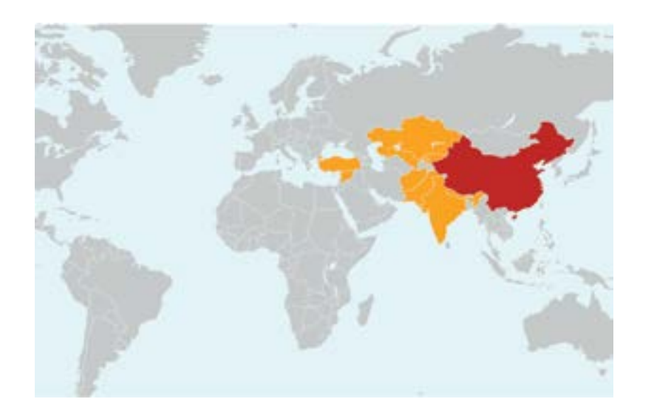
FIGURE 1: Map of China's Transnational Repression of Uyghurs, stages 2 and 3 throughout phase one (1997–2007). Created by Woodrow Wilson Center for International Scholars.<sup>2</sup>