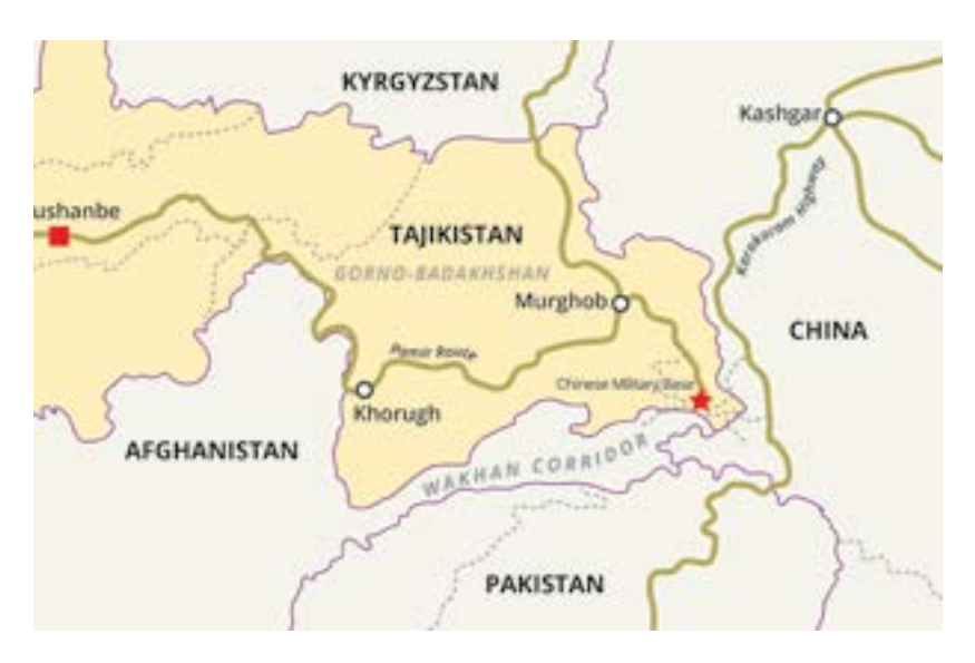
FIGURE 15: Location of China's strategic facilities in Tajikistan overlooking Afghanistan's Wakhan Corridor, near the Chinese border. Created by Woodrow Wilson Center for International Scholars.

In lock-step with power projection into Central and South Asia, China's government has been ramping up security in the Uyghur region itself. On August 29, 2016, China appointed Chen Quanguo<sup>116</sup> as regional Party Secretary of the XUAR, marking the start of a turn toward full Orwellianism.<sup>117</sup> The surveillance system implemented by Chen includes a database of Uyghur region residents that intrusively monitors habits, religiosity, and other personal traits to assess "loyalty" to the Party and state (see chapter five).<sup>118</sup> Events in Central Asia have worked to reinforce these extreme measures. On August 30, 2016, exactly one day after Chen took