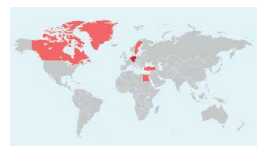
FIGURE 4: Cyberattacks on Uyghurs worldwide (2002–2021). This map shows the 2,774 cases of cyberattacks in the China's Transnational Repression of Uyghurs Dataset, a majority of which targeted the World Uyghur Congress in Germany. The image does not include two telecom hacking incidents in Kazakhstan and Pakistan, as there were no detailed numbers reported in international media. Created by Woodrow Wilson Center for International Scholars.<sup>6</sup>

See map below for reported cyberattacks: