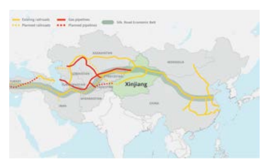
FIGURE 14: Map showing the importance of the Uyghur region to China's vision of global connectivity. Created by Woodrow Wilson Center for International Scholars.

Beijing hopes to quell unrest by better connecting the Uyghur region to both domestic and international markets. The growing influence of China as an economic partner around the world has brought with it an enhanced Chinese security presence that allows Beijing to surveil and repress Uyghurs far beyond its borders.