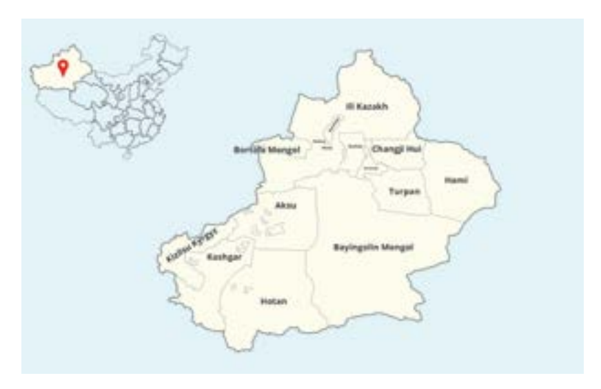
FIGURE 9: The territorial divisions of the Xinjiang Uyghur Autonomous Region emphasizing ethnic minority regions. Created by Woodrow Wilson Center for International Scholars.

Uyghurs have been listed in the XUAR's official name since 1955 as the custodians of the region, they found themselves nestled within a complex patchwork of sub-autonomies designed to dilute their influence. Soviet historian Yuri Slezkine had described the USSR as a communal apartment in which nations are confined to their rooms, but Russians can enter at will, in addition to having control over the building and its hallways. The Uyghurs in the PRC found that even their living space had been divided up into something altogether more claustrophobic, like a New York convertible studio apartment.