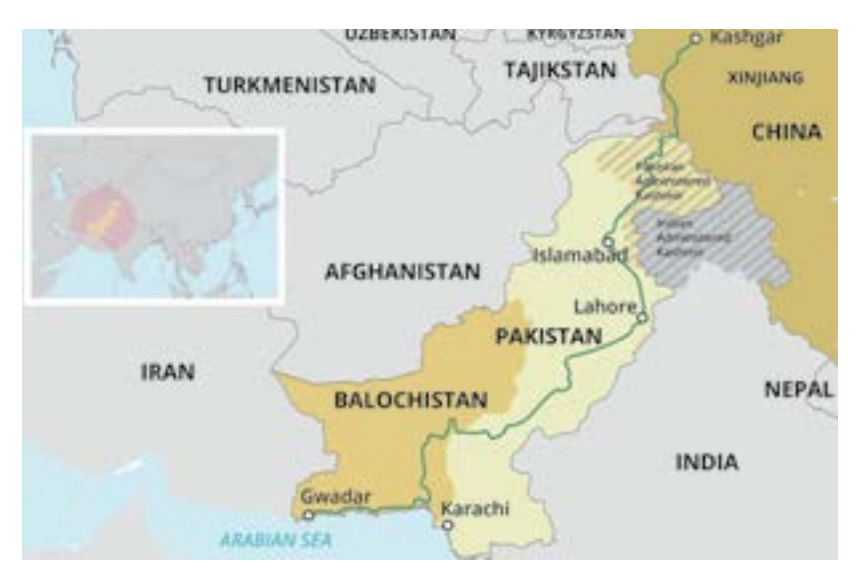
FIGURE 17: Map of the current Karakoram Highway route linking Uyghur cultural center Qäshqär with China's port project in Gwadar. Created by Woodrow Wilson Center for International Scholars.

Due to its role as a significant hajj transit country, the government of China began to pay more attention to security developments in Pakistan from the mid-1990s onward. While there is no evidence of an official agreement between the two countries to monitor Uyghur activities, it is clear that Islamabad had adopted a conciliatory stance toward its powerful neighbor by 1997.<sup>23</sup> That same year, 14 Uyghur students were reportedly deported from Pakistan—the first instance of this practice I am aware of. Those affected were students at a local madrassa but Beijing accused them of "separatism" in the wake of unrest in the northern XUAR of Ghulja, near the Kazakh border.<sup>24</sup> Pakistan, which had been deepening its security arrangements with its northern neighbor, saw such measures as an opportunity to build rapport. The year it deported 14 Uyghur students, Islamabad