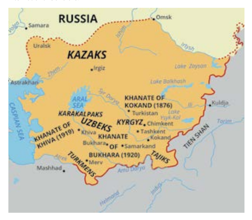
FIGURE 10: The Russian Empire's expansion into Central Asia throughout the 19th and 20th centuries.