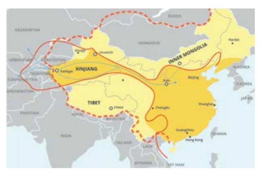
FIGURE 5: Map of historical boundaries of the Han (dark yellow), Tang (red), and Qing Dynasties (broken red line), respectively. Created by Woodrow Wilson Center for International Scholars.

Official historiography conveniently ignores these ebbs and flows of Chinese influence in the region and instead stresses continuity. In 2003, China's Communist officials released a white paper titled "The History and Development of Xinjiang," which argues that the region has been an "inseparable part of the unitary multi-ethnic Chinese nation since the Han dynasty." Despite such claims, the sprawling Uyghur region only became part of a Chinese state project following the mid-18th century Qing conquest.