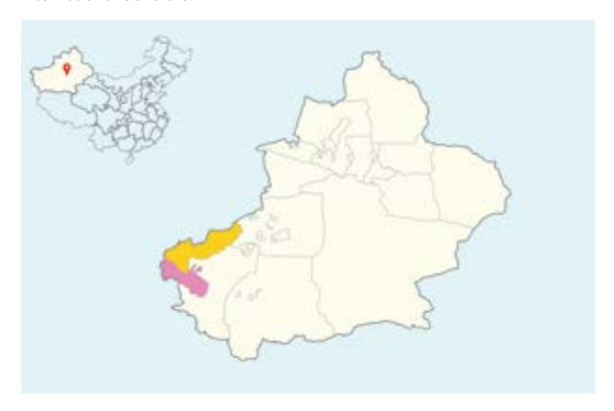
FIGURE 12: Location of Baren Township within the Xinjiang Uyghur Autonomous Region. Created by Woodrow Wilson Center for International Scholars.

In the aftermath, Chinese security services arrested 1,831 Uyghurs after accusing them of having links to "separatist counter-revolutionary organizations." In 1991, over 10 percent of the region's 25,000 Uyghur clerics were dismissed from work by China's authorities, marking a shift back to hardline assimilationist policies. <sup>14</sup>