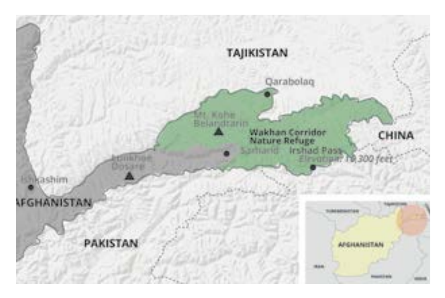
FIGURE 11: A map of the Wakhan Corridor today. This narrow strip of land borders China, Afghanistan, and Pakistan. Created by Woodrow Wilson Center for International Scholars.

Today, in the town of Shaymak in Tajikistan, in the Central Asian highlands, China seeks to project power into the region to stifle Uyghurs. The roof of the world now hosts Sitod ("Headquarters" in the Tajik language), a Chinese strategic facility that silently guards the ancient Silk Road passage. To the Wakhan Corridor's south lies greater Kashmir, a hotly contested geopolitical flashpoint between India, Pakistan, and China. To the east, across the snowy Wakhjir Pass, lies the Uyghur region. As the security situation in Afghanistan remains uncertain, Beijing views this chokepoint as a possible conduit through which Uyghur militants in Afghanistan